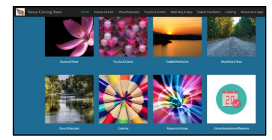
Example of a virtual calming room (Robbinsdale Area Schools)