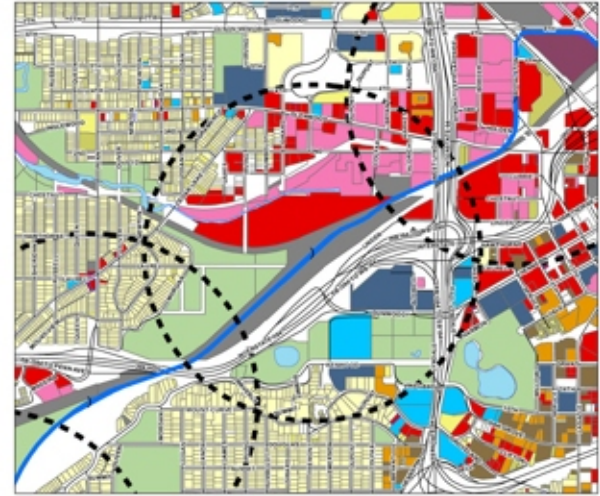
EXISTING LAND USE