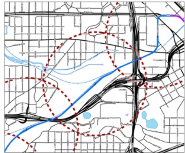
EXISTING STREET NETWORK