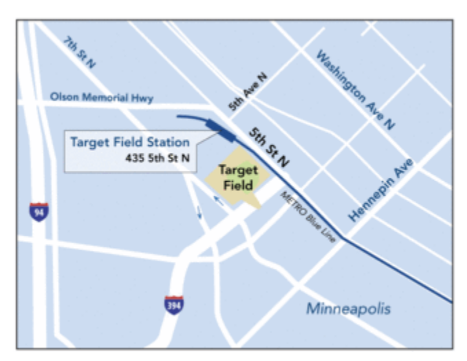
Click (map) for directions

For help planning your trip on Metro Transit, call 612-373-333 to speak to a transit expert or use the online Trip Planner at <a href="www.metrotransit.org">www.metrotransit.org</a>. There will be regular Saturday METRO Blue Line service and special Twins game service on the Northstar commuter rail.