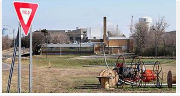
5725 Highway 7, St. Louis Park

Description: Vacant former McGarvey Coffee plant, a 29,218-square-foot Class C manufacturing building, built in 1947 on 1.8 acres