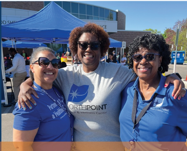
Pictured: Free Fresh Food Fridays Volunteers