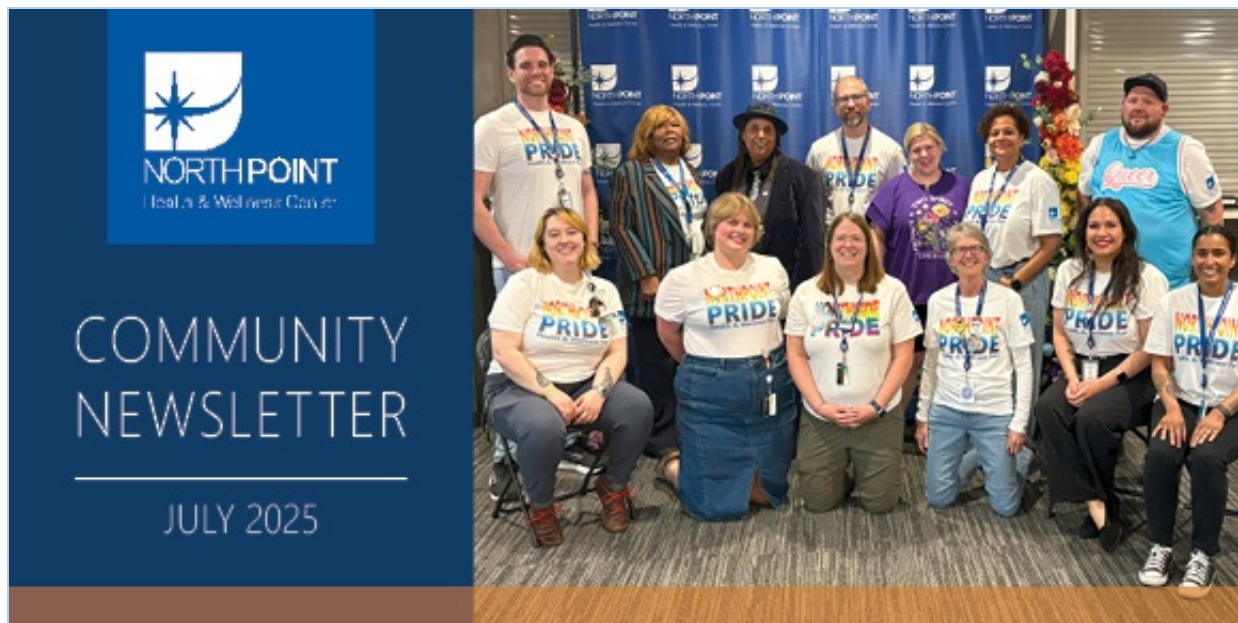
Pictured: NorthPoint Pride Health & Wellness Resource Fair Staff and Guests