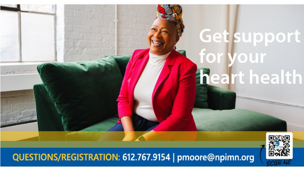
NorthPoint Health & Wellness Center | 2220 Plymouth Ave N, Minneapolis, MN 55411 | www.northpointhealth.org

campus: 2220 Plymouth Avenue North, Minneapolis, MN 55411. We hope to see you there!