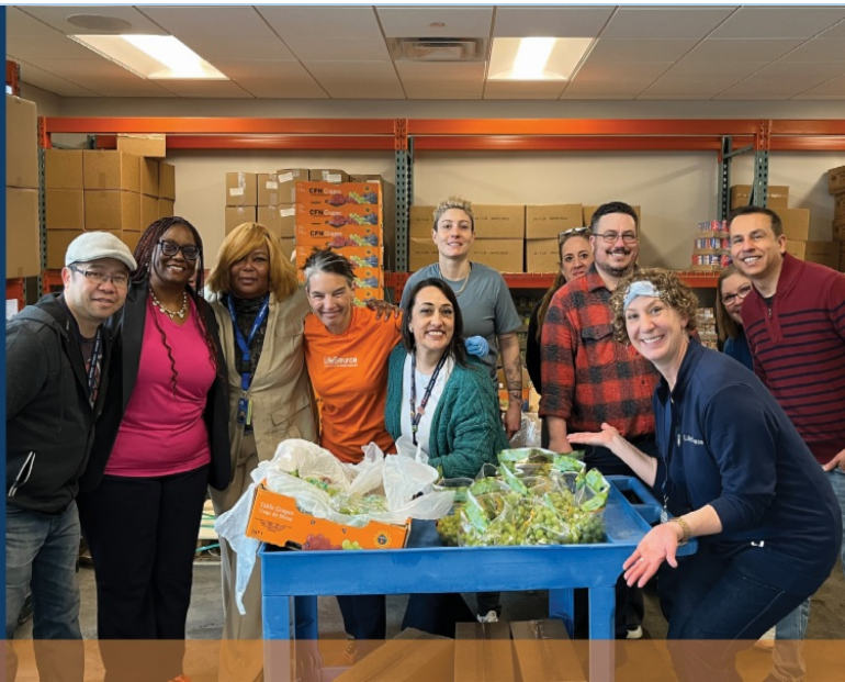
Pictured: Food Shelf Volunteers and NorthPoint Staff