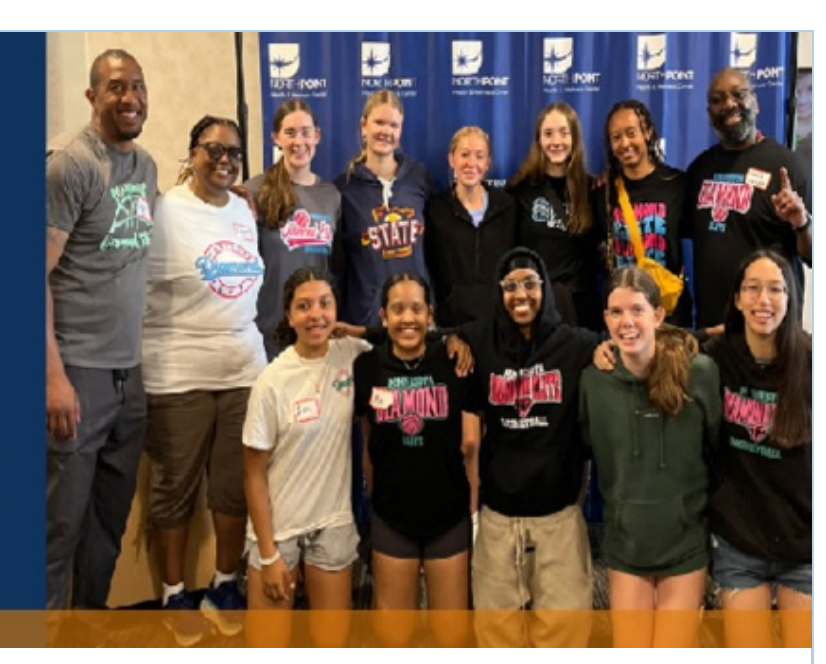
Pictured: Free Fresh Food Fridays Volunteers