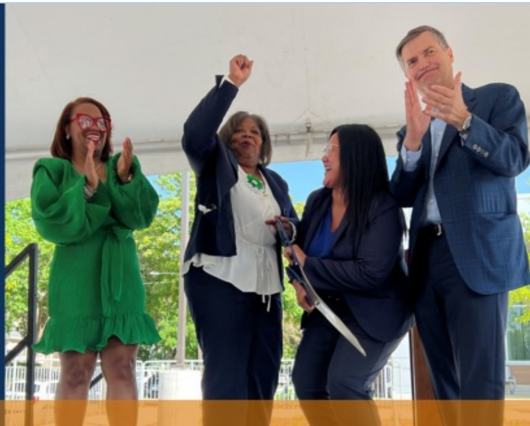
Pictured: NorthPoint Ribbon Cutting