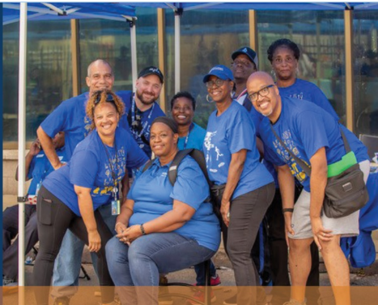
Pictured: NorthPoint Staff at Fit4Fun 2023