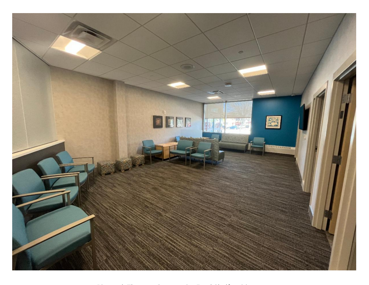
Pictured: The new Community Food Shelf waiting room