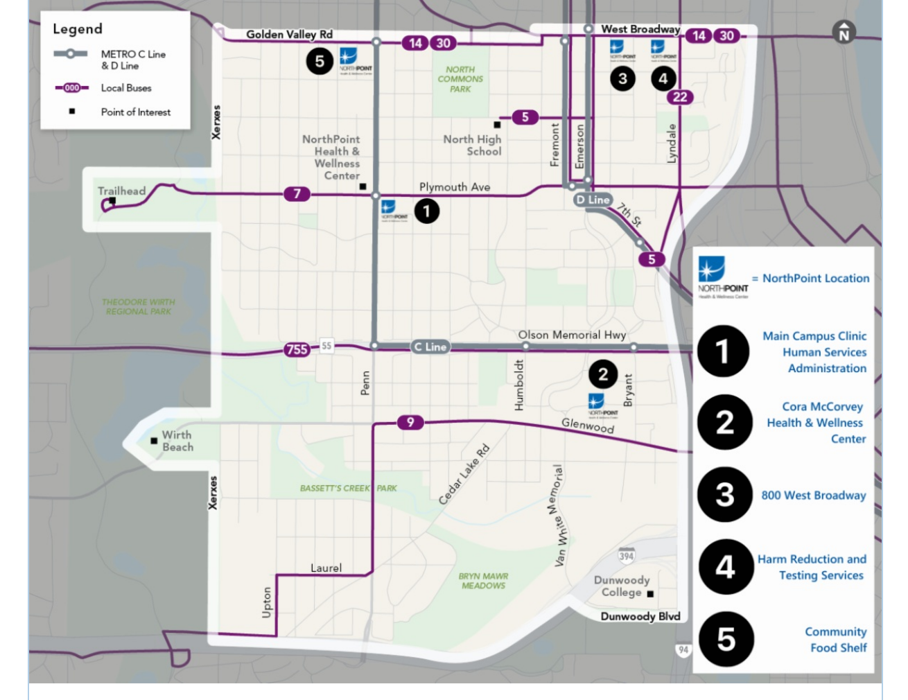
Pictured: Metro Transit micro service area map with NorthPoint locations