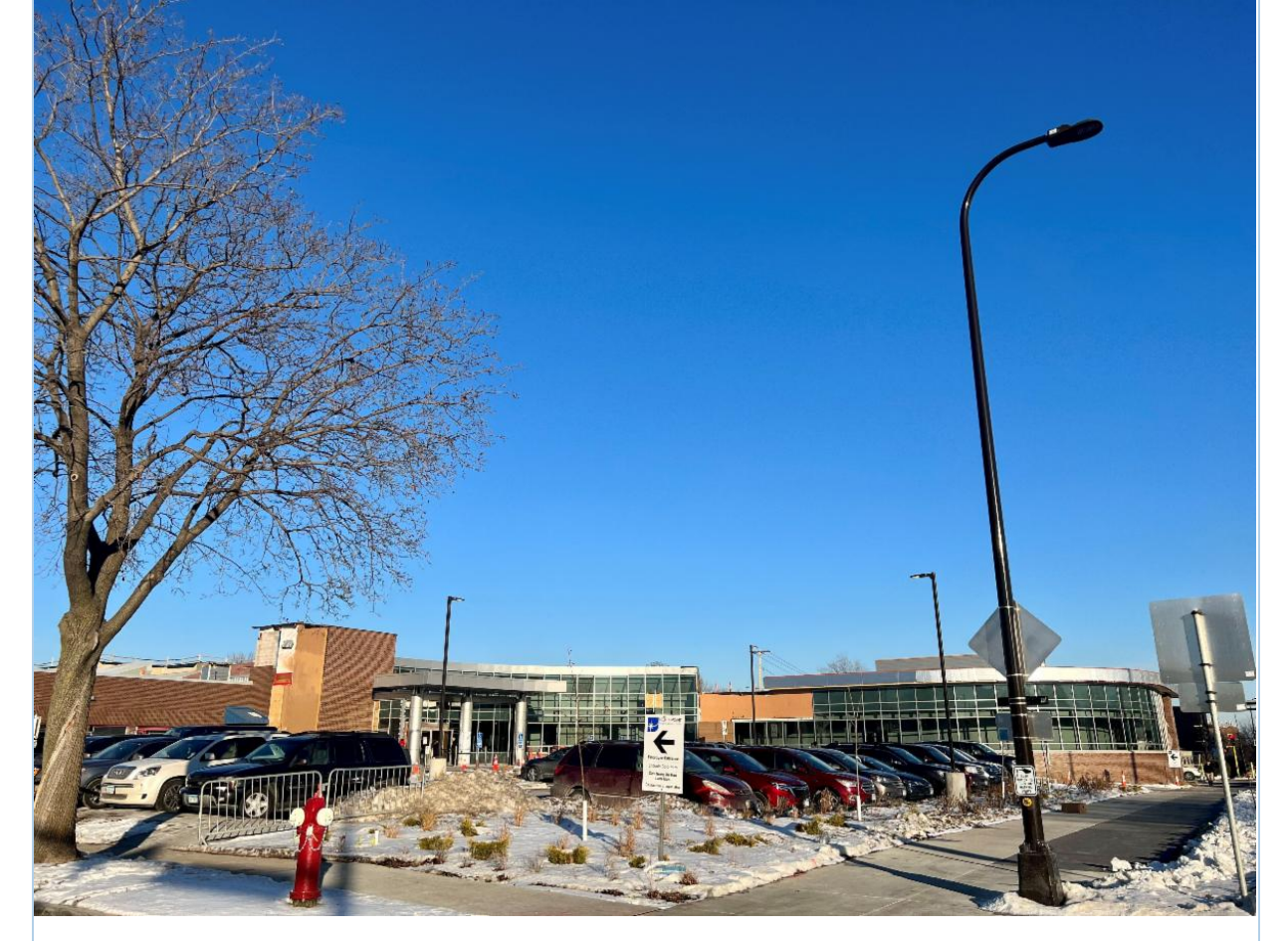
Pictured: The new NorthPoint main campus entrance on Plymouth Ave N

Effective January 1, 2023, our address is 2220 Plymouth Ave N, Minneapolis, MN 55411 . We are staying in the same familiar spot in the heart of North Minneapolis at the corner of Penn and Plymouth, but as our building grows, our entrance has permanently moved to the Plymouth Ave side .