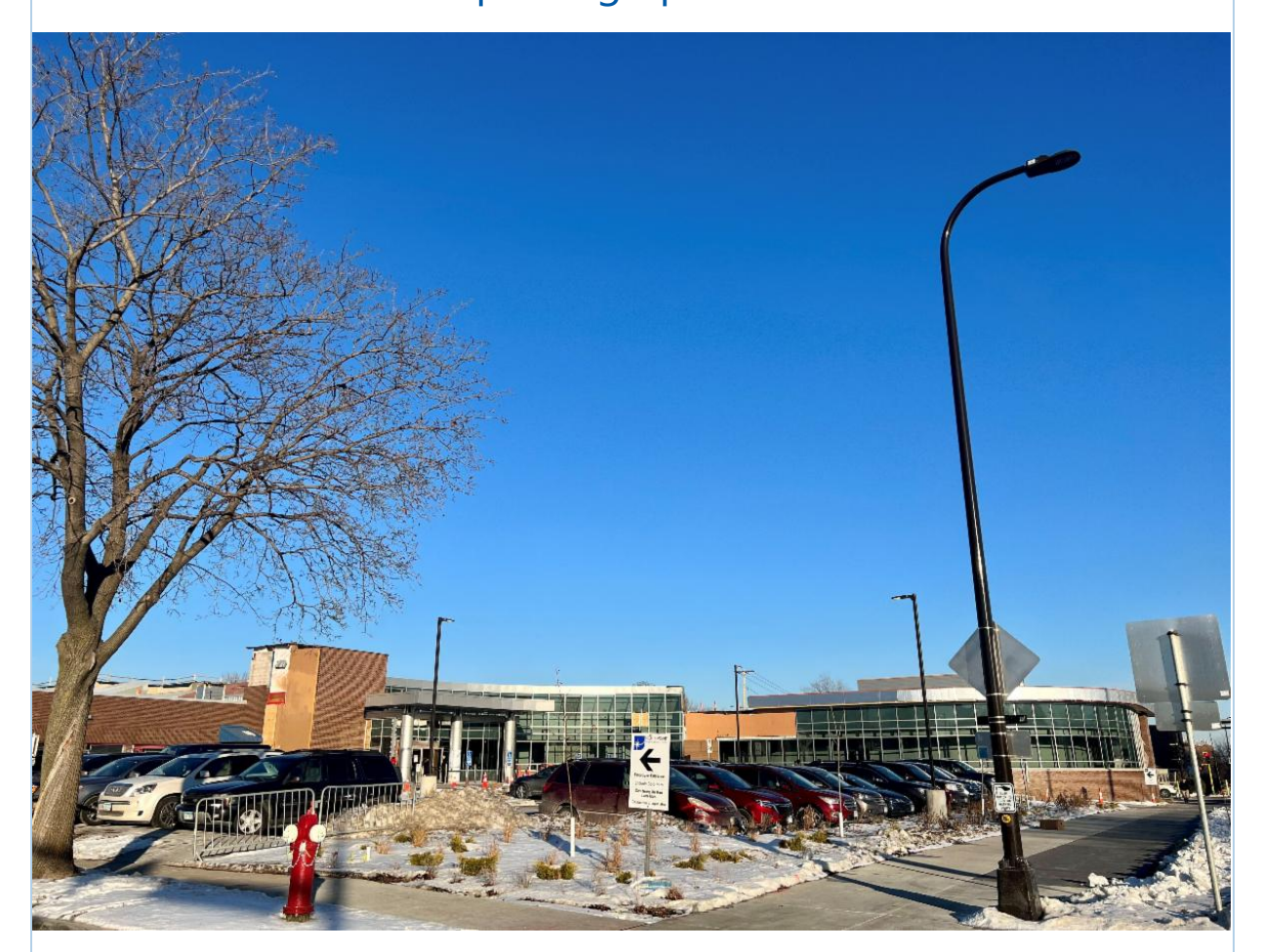
Pictured: The new NorthPoint clinic patient entrance on Plymouth Ave N

Beginning in early September, the NorthPoint clinic entrance moved to its final, permanent entrance on Plymouth Ave N. All patients will enter the clinic from this new main entrance, pictured below.