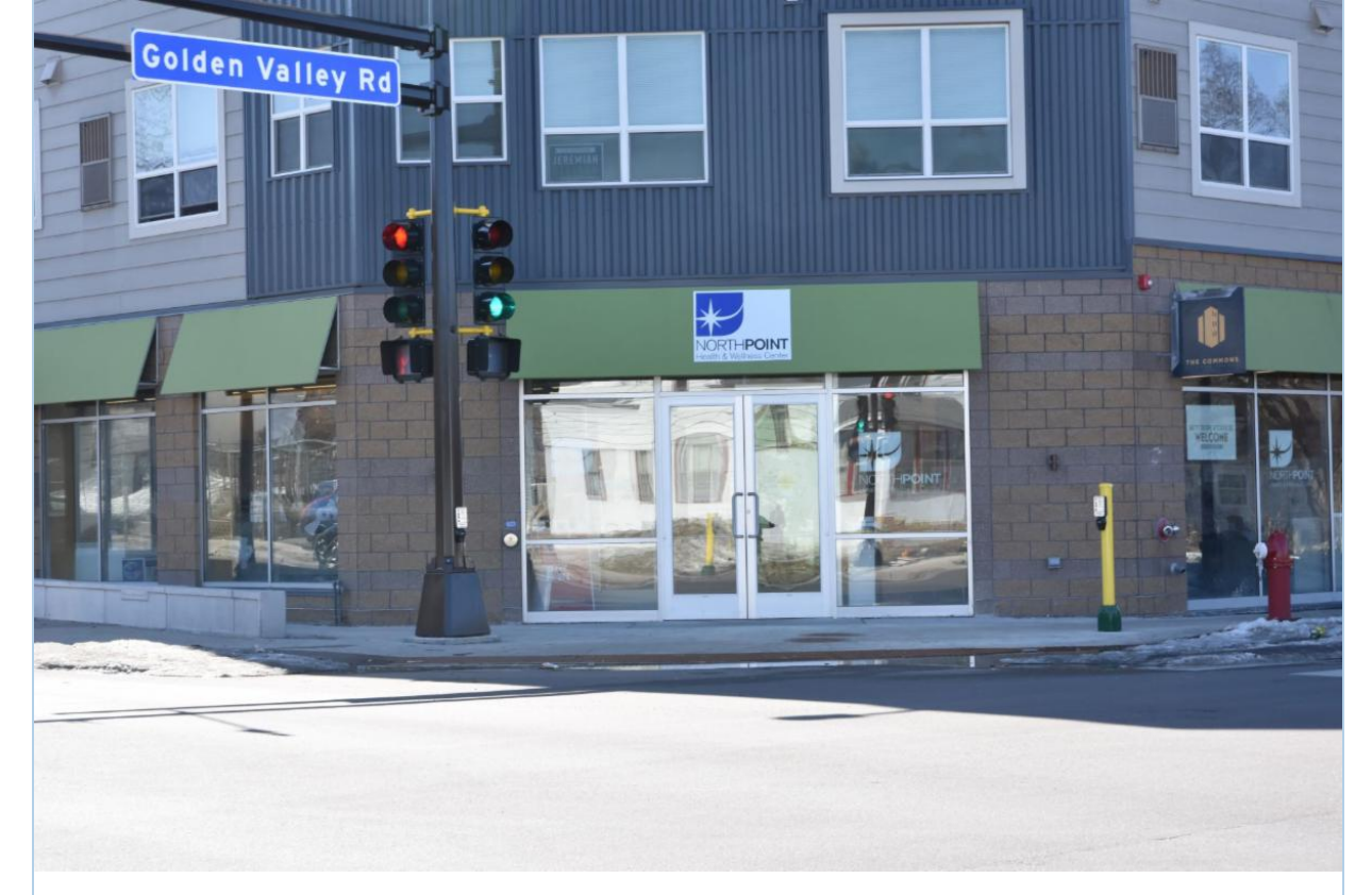
Pictured: NorthPoint Community Food Shelf on the corner of Penn Ave N & Golden Valley Road