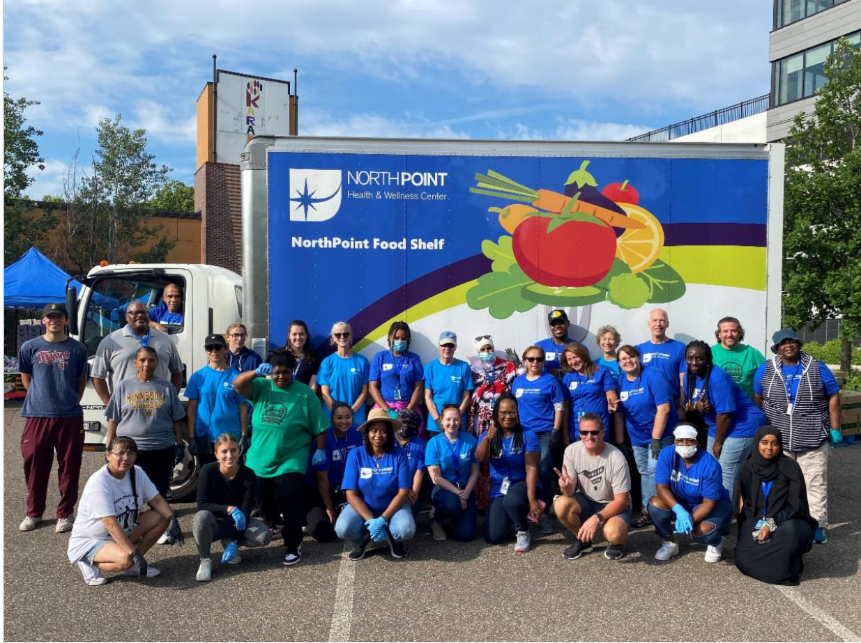
Pictured: NorthPoint's Community Food Shelf staff and volunteers