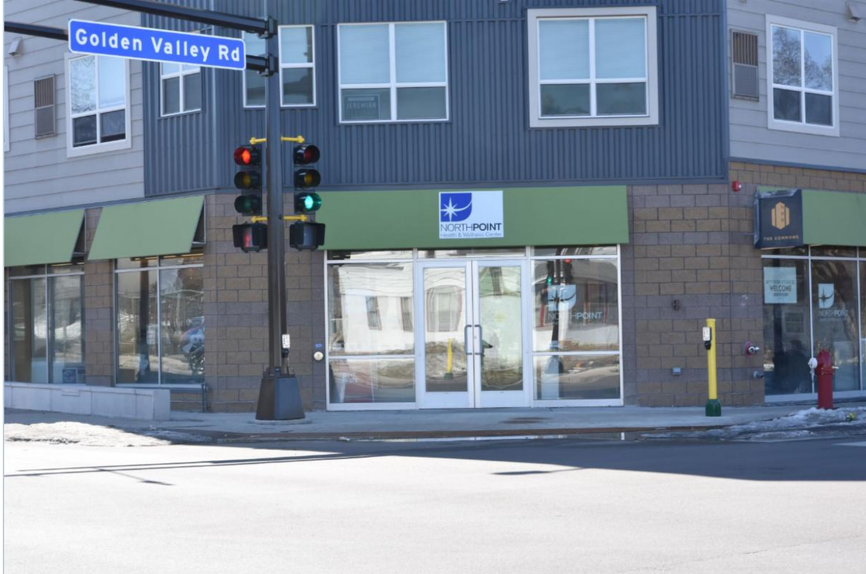
Pictured: NorthPoint Community Food Shelf on the corner of Penn Ave N & Golden Valley Road