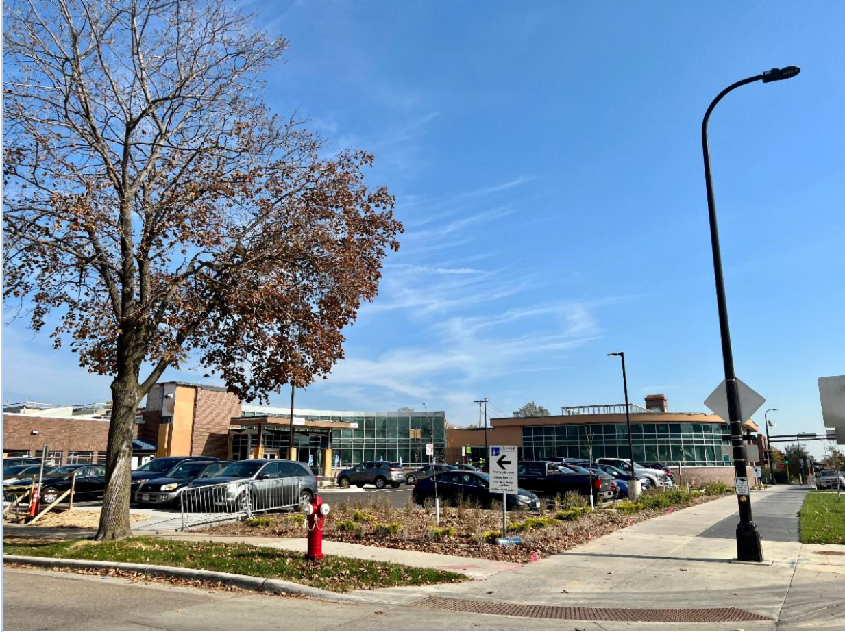
Pictured: The new NorthPoint clinic patient entrance on Plymouth Ave N