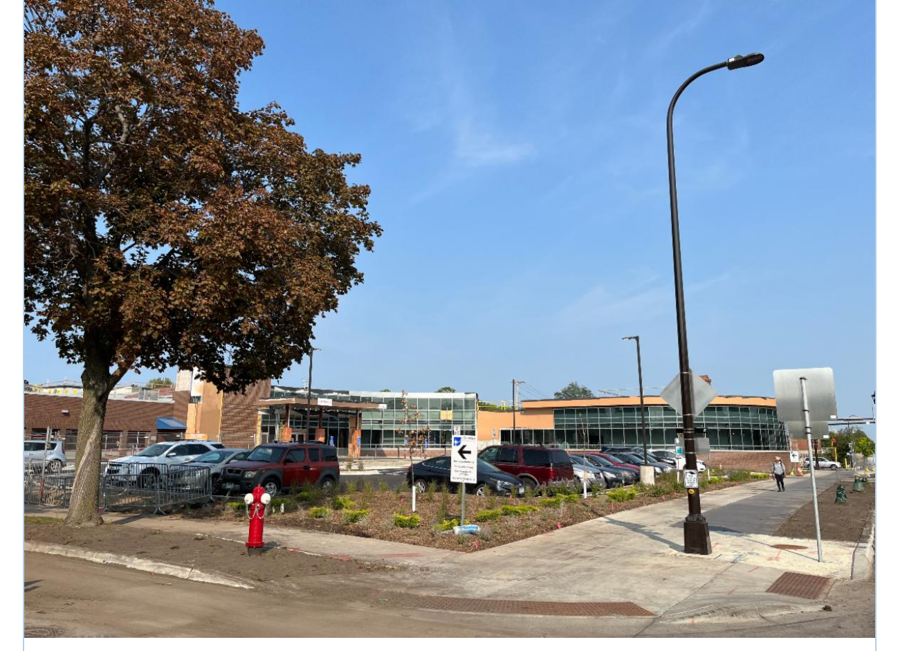
Pictured: The new NorthPoint clinic patient entrance on Plymouth Ave N