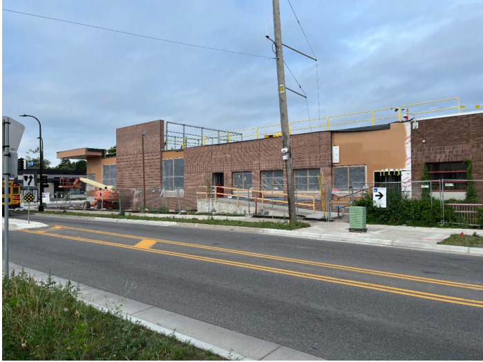
Pictured right: North addition from Penn Ave. The exterior envelope will be finishing in August. This building will house additional NorthPoint services.