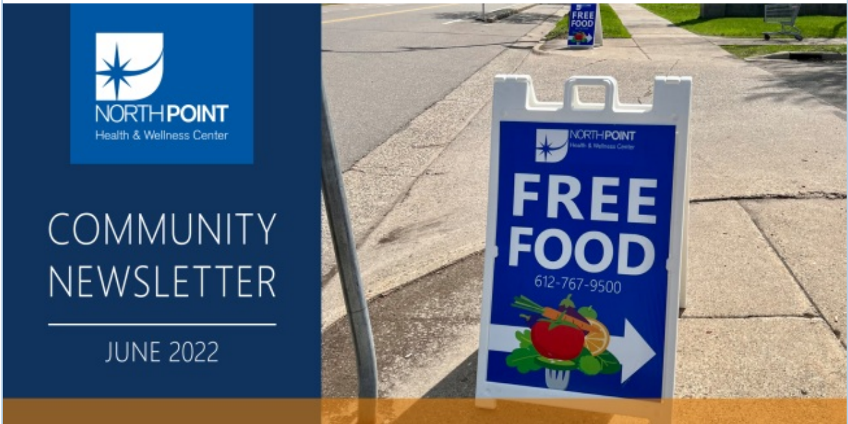
Pictured: Free Fresh Food Fridays entrance on Plymouth Ave N