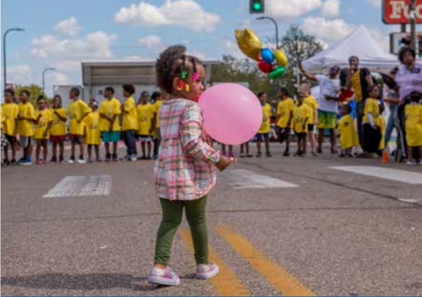
Starting line for Kid's Run | FIT 4 FUN

Served nearly 16,000 individuals from over 5,900 households.