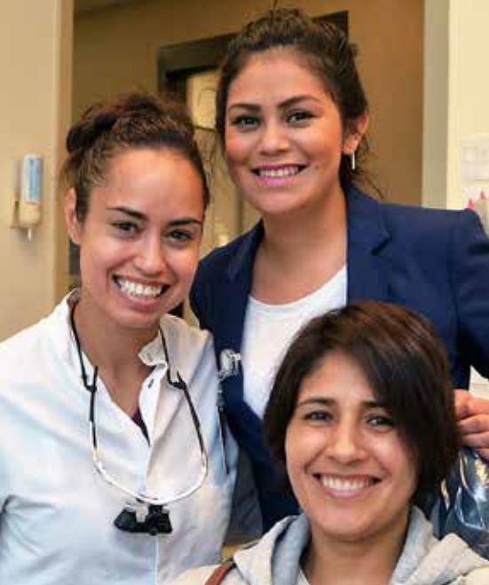
Staff & Patient | COACH PROGRAM