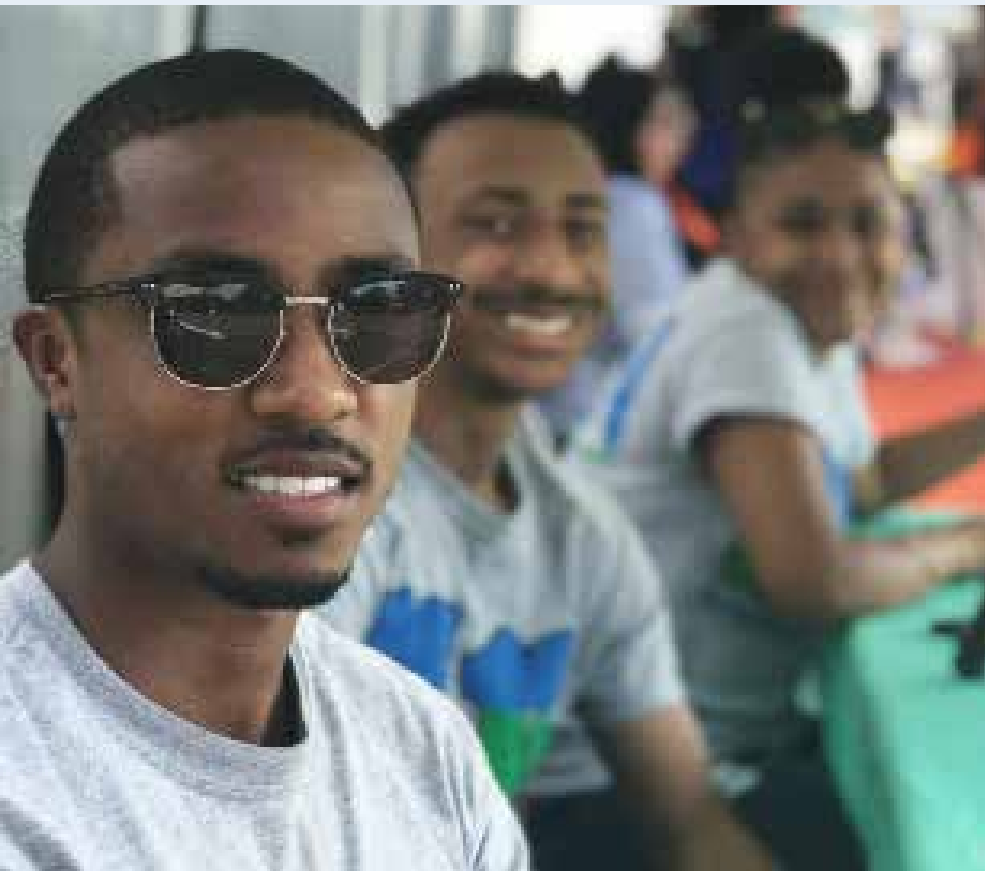
Breathe Free North | COMMUNITY OUTREACH

602 volunteers donated more than 14,900 hours of service to NorthPoint.