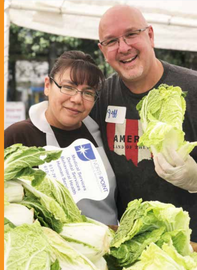
Volunteers | OUTDOOR MARKET

Served nearly 16,000 individuals from over 5,900 households.