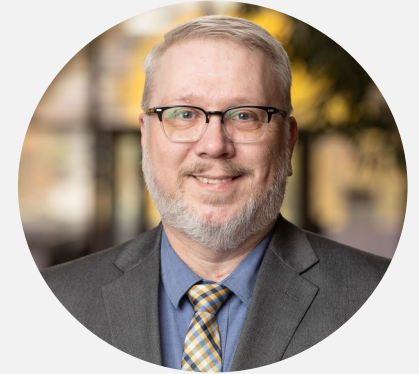
Scott Busche Law, Safety & Justice IT