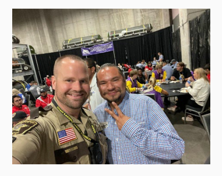
HCSO 'Auto Theft Unit' seeing improvement, MPLS data backs it up

Epidenick June 28, 1024 - 1150 456 Schöderff - pp. 15, 2024 - 120 101