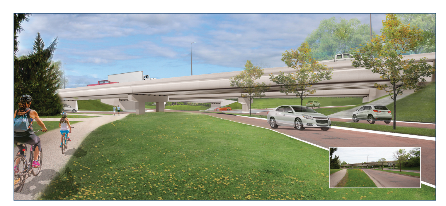
Looking north from Theodore Wirth Parkway