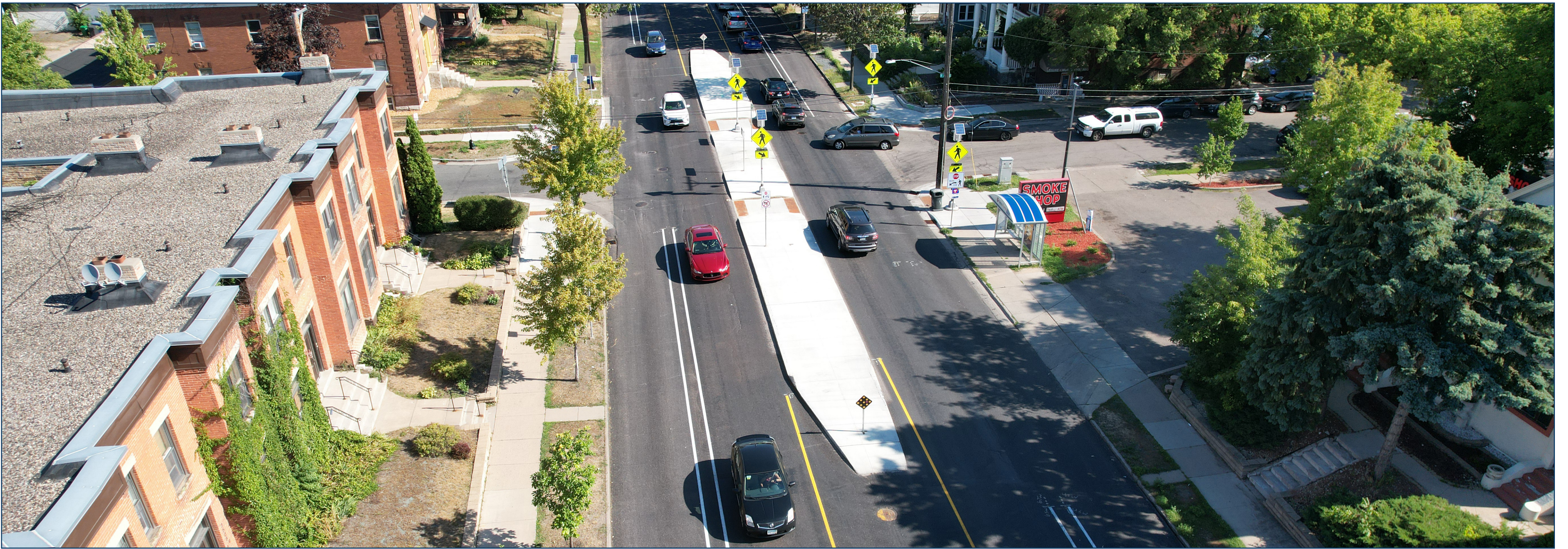
25th Street median