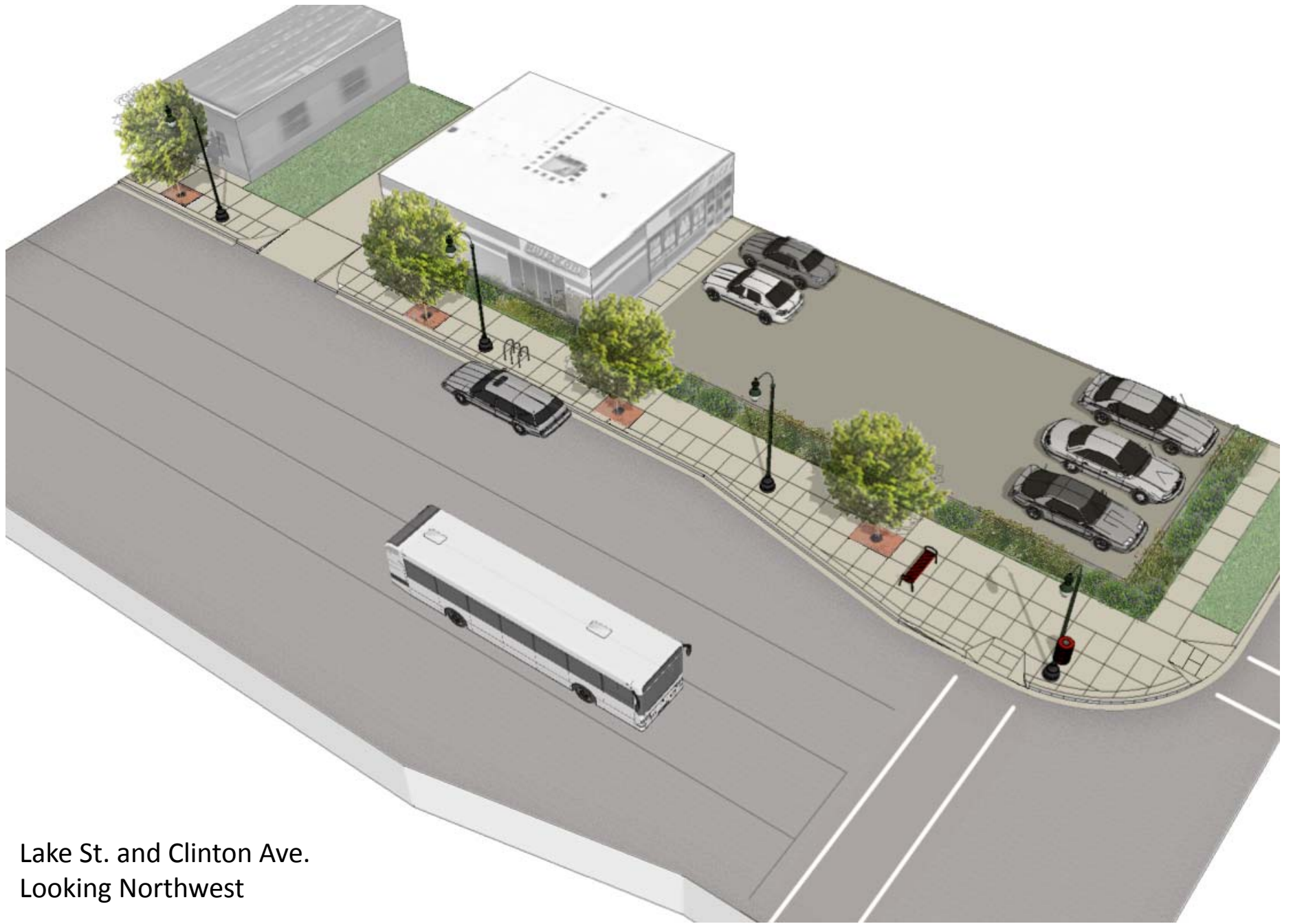
Lake St. and Clinton Ave. Looking Northwest