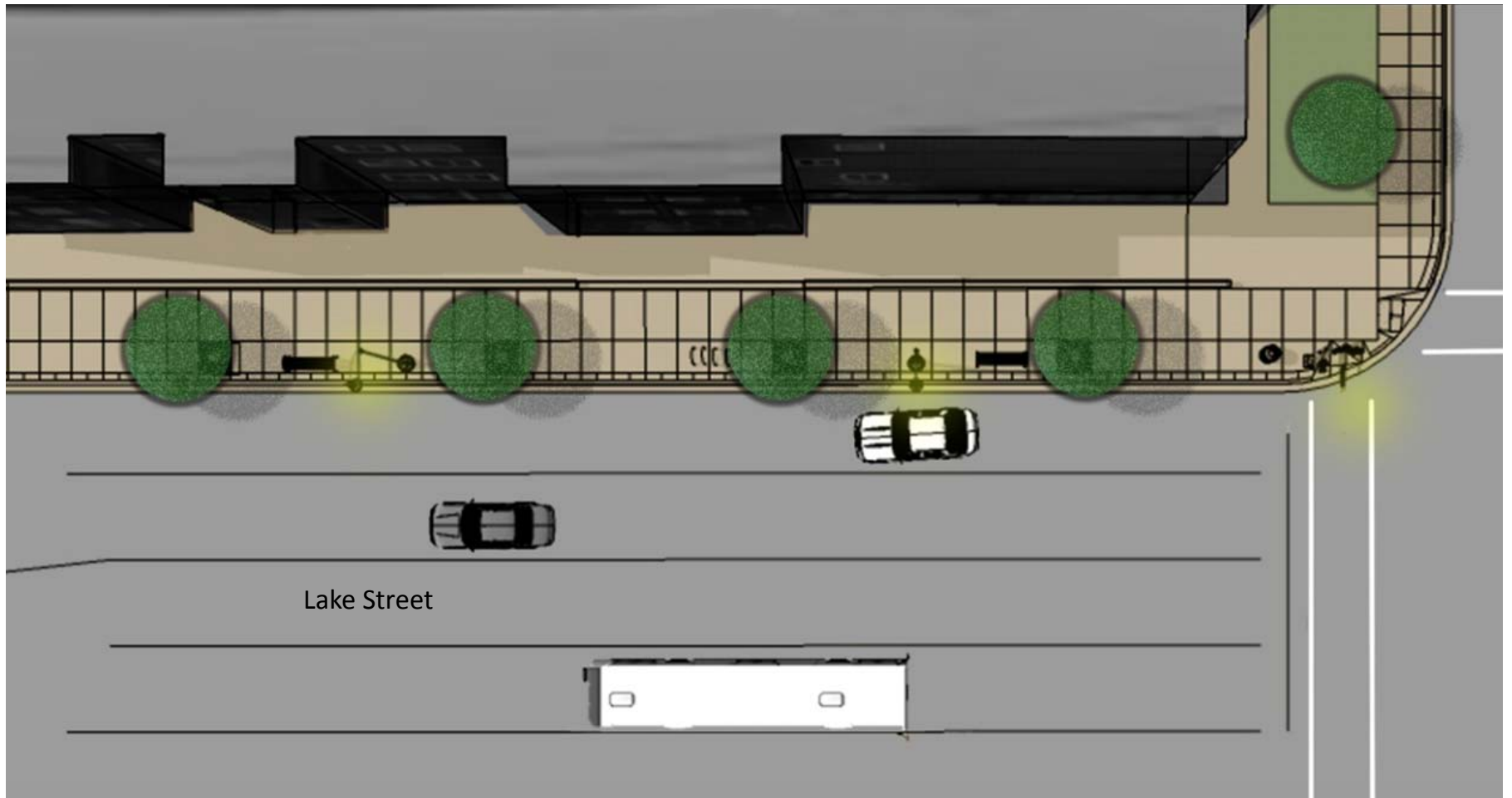
Lake Street and Blaisdall Ave. Streetscape Concept Plan