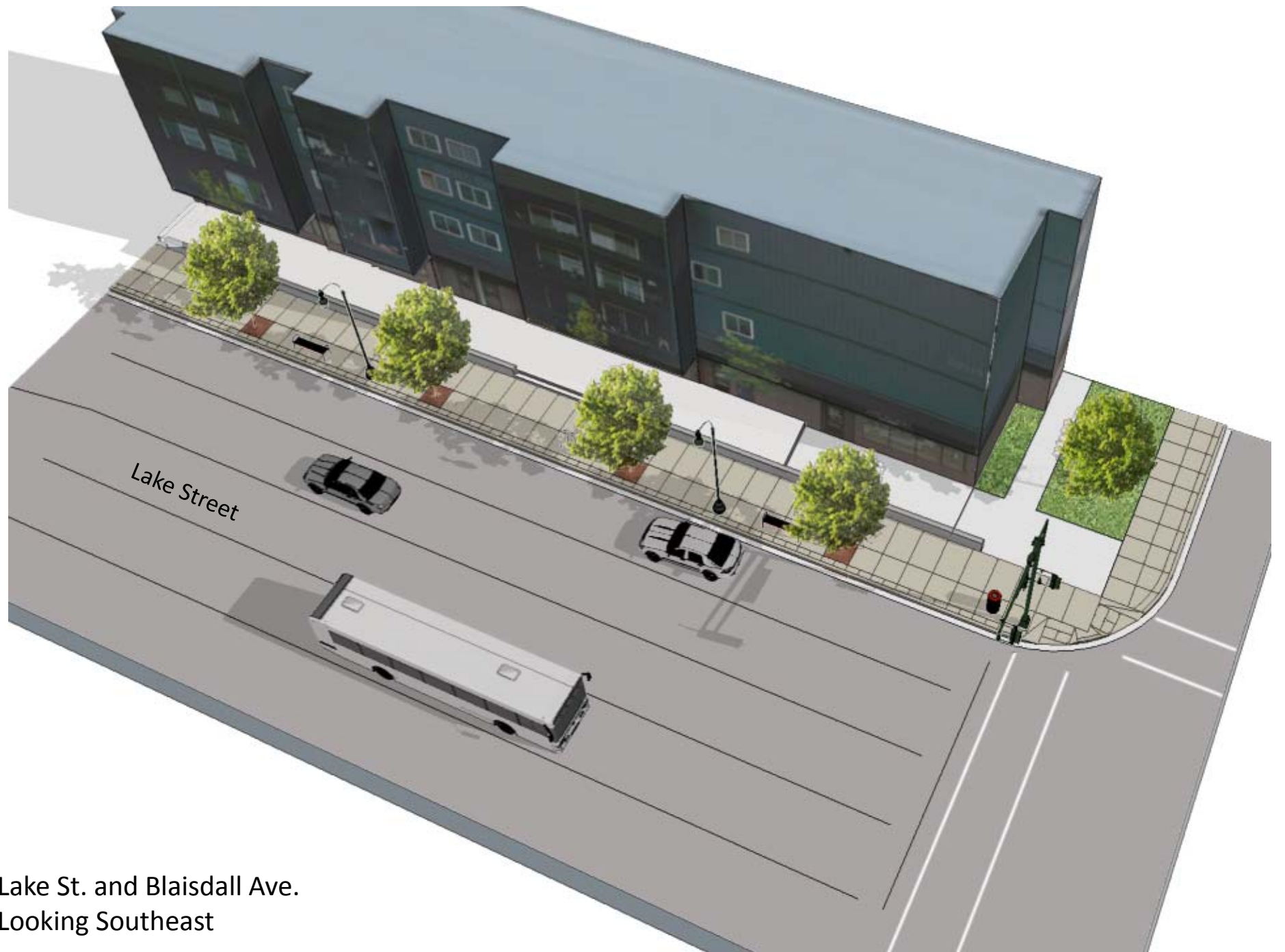
Lake St. and Blaisdall Ave. Looking Southeast