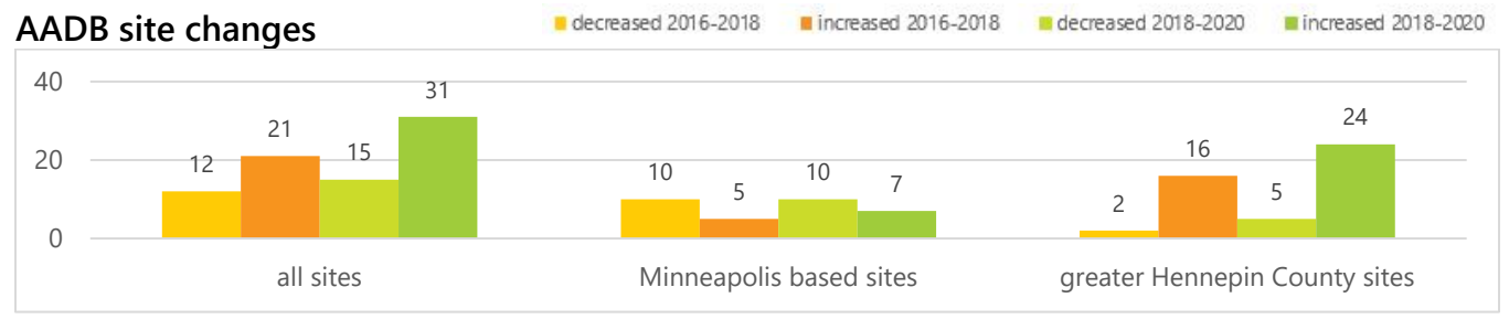
Figure 2: Illustrates overall trends in sites that decreased or increased from 2016 to 2018, then 2018 to 2020. Sites are also reviewed based on sites within Minneapolis and outside the city, or Greater Hennepin County sites.

Figure 1: The figure above illustrates average AADB from 2016 through 2020. AADB estimates are illustrated by all sites, then distinguished by Minneapolis based sites and sites outside of the City of Minneapolis, or Greater Hennepin County sites.