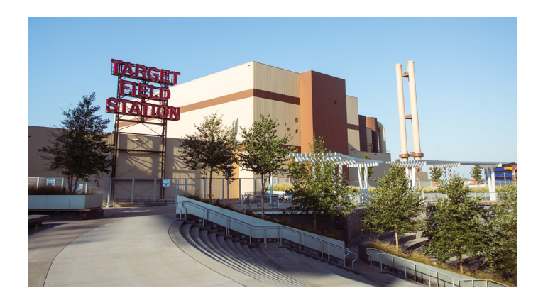
The Hennepin Energy Recovery Center (HERC) in downtown Minneapolis.

In Hennepin County, waste is either hauled directly to the Hennepin Energy Recovery Center (HERC) or a land disposal facility. Waste may also be taken to a transfer station where waste is loaded into trailer trucks and transported to landfills farther away. In the Twin Cities, there are 19 transfer stations; 14 are licensed to accept MSW and five to accept only construction and demolition (C&D) waste.