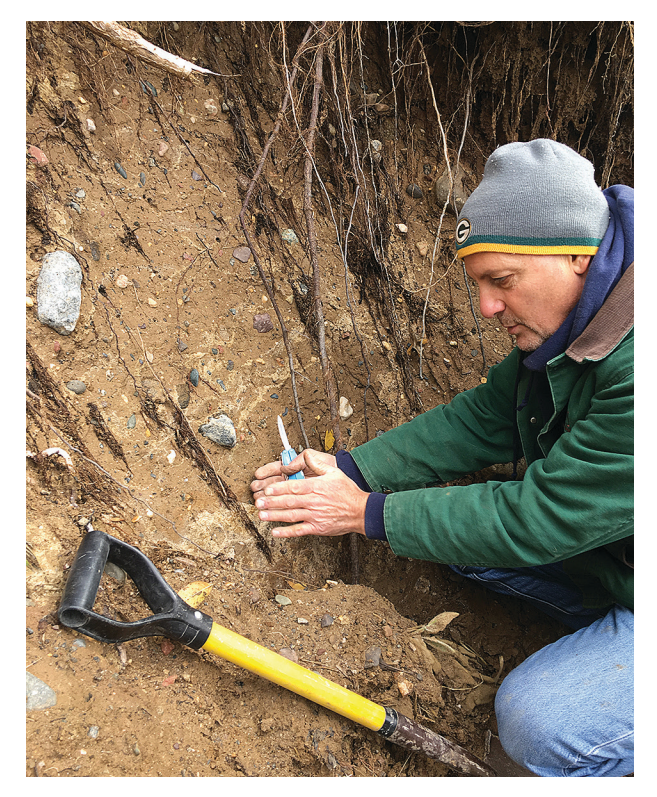
Figure 8.1— Soil Investigation

The main commonality in these sites in the interior of the county was a sharp increase in density at shallow depth, typically within a meter or two of the surface. This was determined by ease of coring and by inspection with a shovel (Figure 8.1). A decrease in density of the surface layer could result from frost heave, bioturbation or human disturbance. It may also result from the original processes that deposited the glacial sediment with normally consolidated supraglacial sediment overlying over-consolidated subglacial sediment. In the case of the site in Theodore Wirth Park, some degree of compaction appeared to have resulted from trail use by people on foot and bicycle. More loosely consolidated sediment appeared to have been spread in attempts to improve the site through re-grading and planting (Figure 8.1).