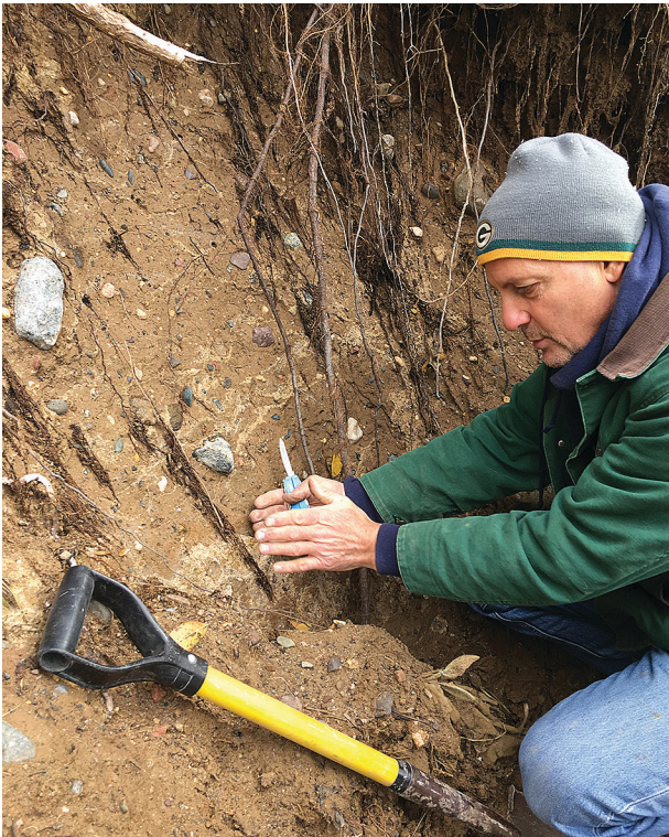
Figure 8.1— Soil Investigation

The main commonality in these sites in the interior of the county was a sharp increase in density at shallow depth, typically within a meter or two of the surface. This was determined by ease of coring and by inspection with a shovel (Figure 8.1). A decrease in density of the surface layer could result from frost heave, bioturbation or human disturbance. It may also result from the original processes that deposited the glacial sediment with normally consolidated supraglacial sediment overlying over-consolidated subglacial sediment. In the case of the site in Theodore Wirth Park, some degree of compaction appeared to have resulted from trail use by people on foot and bicycle. More loosely consolidated sediment appeared to have been spread in attempts to improve the site through re-grading and planting (Figure 8.1).