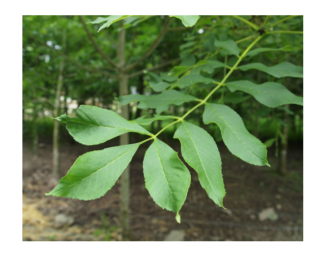
Compound leaves, or multiple leaves on one stalk