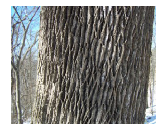
Diamond-shaped pattern on bark