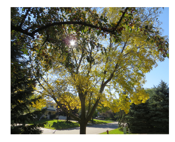
Branches grow directly opposite from one another