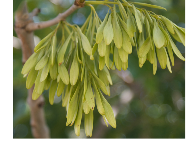
Oar-shaped seeds that typically hang in clusters

If you have ash trees on your property, learn about options for saving your tree or get tips for removal and replanting at hennepin.us/ashtrees