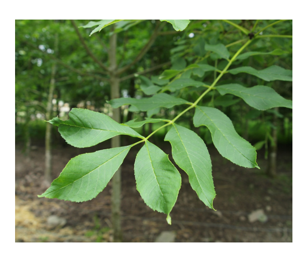
Compound leaves, or multiple leaves on one stalk