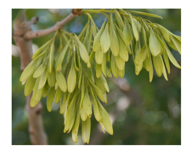
Oar-shaped seeds that typically hang in clusters