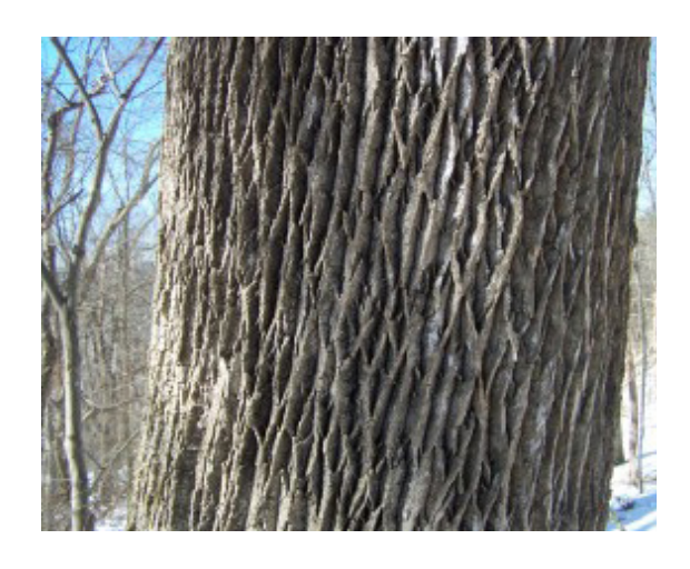
Diamond-shaped pattern on bark