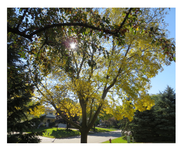
Branches grow directly opposite from one another

Look for the following characteristics to determine if your tree is an ash tree: