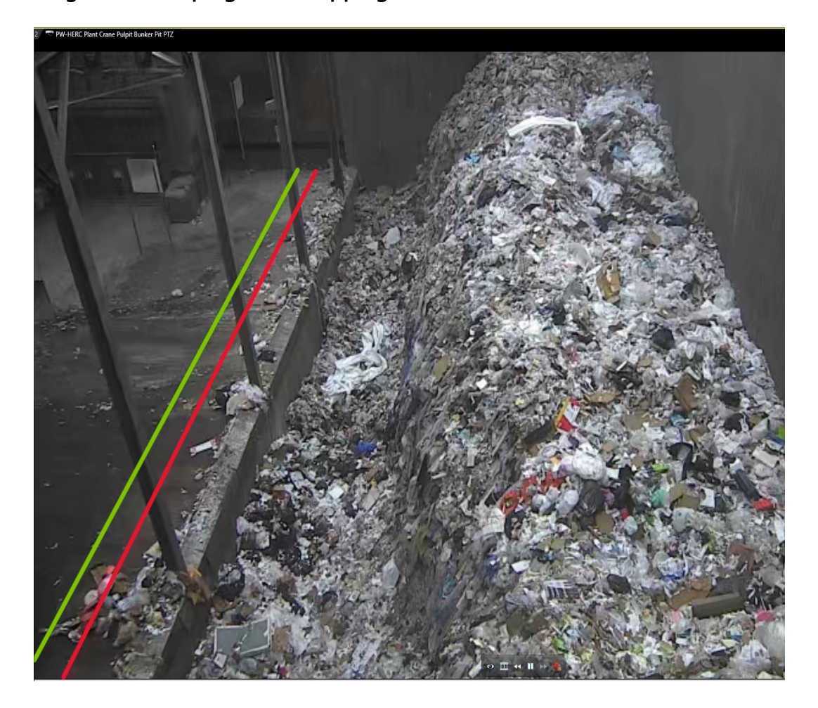
Figure 2: Dumping on the tipping floor