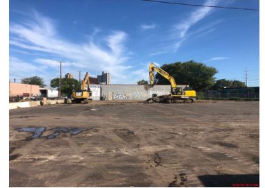
Minobimaadiziwin Mpls site before

ERF funding can be the critical piece that brings redevelopment projects and businesses to vacant properties. By transforming sites from public safety nuisances into community assets, redeveloping vacant properties can reduce crime.