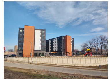
Minobimaadiziwin Mpls site after