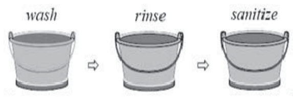
A. Water and Soap B. Clean Water C. Water and Sanitizer