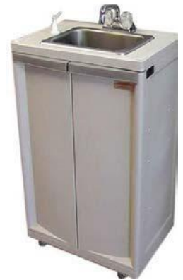
A. Pressurized Hand Washing Sink (Required for events >10 days/year)