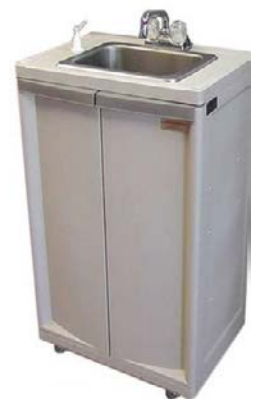
A. Pressurized Hand Washing Sink (Required for events >10 days/year)