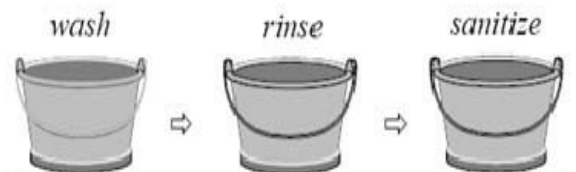
A. Water and Soap