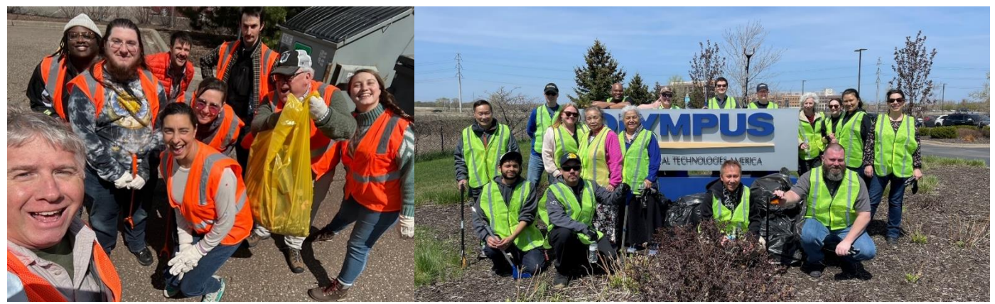
A group of 9 staff with Environmental Initiative (left) picked up 1 bag of litter in Minneapolis. A group of 19 people with Olympus in Brooklyn Park (right) cleaned up 300 pounds of litter.