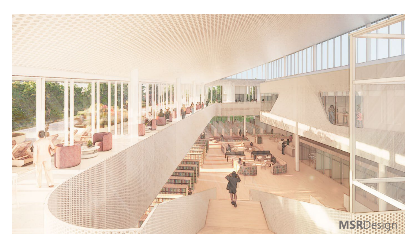
Level 2 highlighting the second-floor library space and outdoor roof terrace.