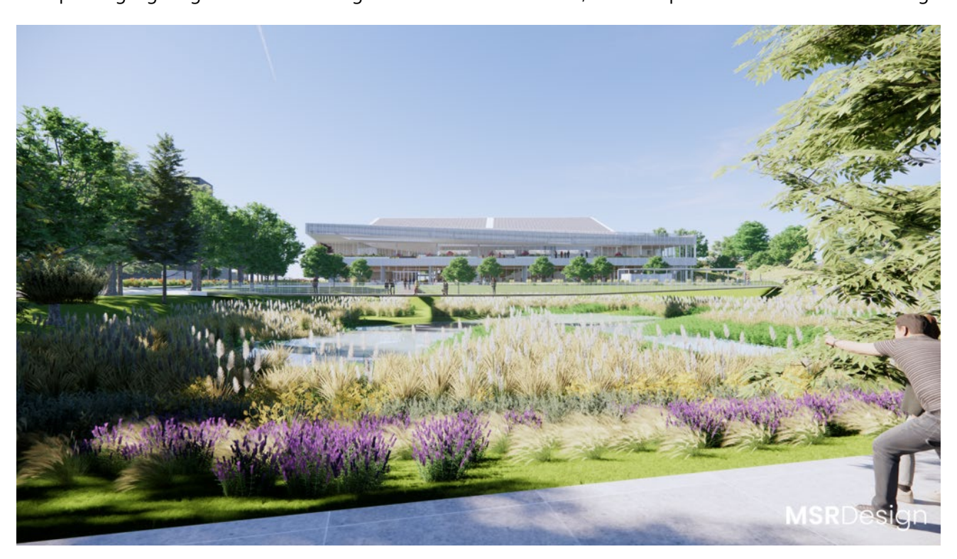
South landscape highlighting native landscape and library building in the distance.