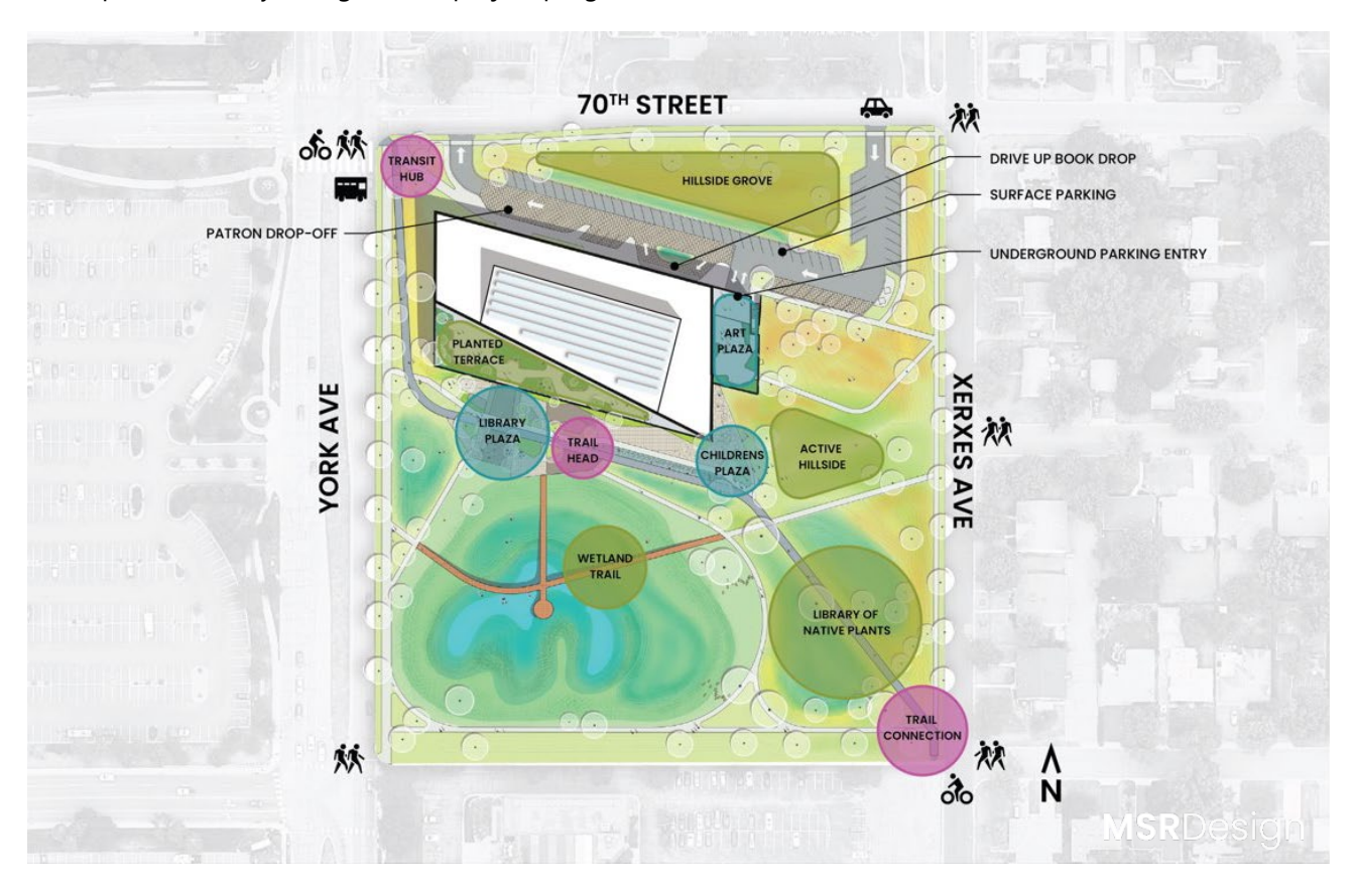
Site plan highlighting where the building will be located on the site, and how patrons will access the building.

These renderings are concepts depicting what the interior and exterior of the new Southdale Library could look like. They are not final plans and may change as the project progresses.