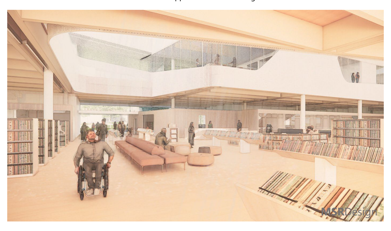
South entry space highlighting the welcoming, accessible, and light-filled library space. This rendering also shows the connection between the first and second floor.